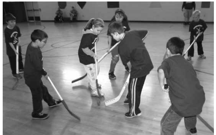
Floor Hockey Group in Action.