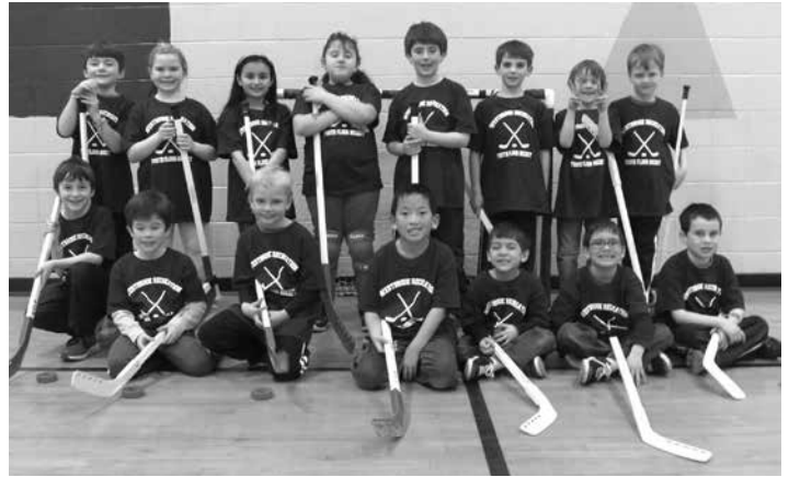
Saturday Morning Youth Floor Hockey Group.

Days are getting longer and warmer, so Spring is just around the corner. That means it must be time to register for our Summer Day Camp. Open registration started on February 1st and is done on a first come basis. Westbrook Recreation now accepts master card and visa for all programs. Payments can be called in at any time for your convenience. A site fee will be assessed for credit and payment. Please remember a two week deposit is required to hold a spot for your child for the whole summer. Sign up soon or your child may miss out on all the Summer Camp Fun! Please call 860-399-3095, with any questions?