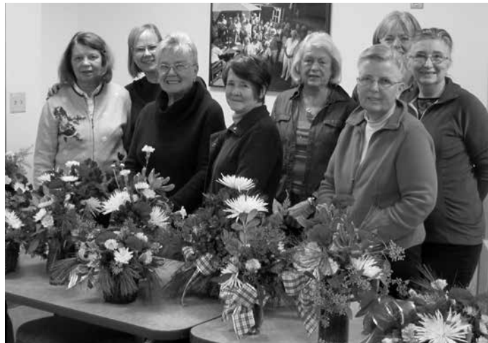
Westbrook Garden Club members at Senior Center Holiday Flower Arranging event.