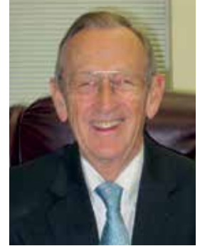
First Selectman Noel Bishop

The Selectman's Office, like all municipal offices is always open and staff is available to respond to inquiries. All of the above noted methods of communication should be frequently utilized in order to be effective.