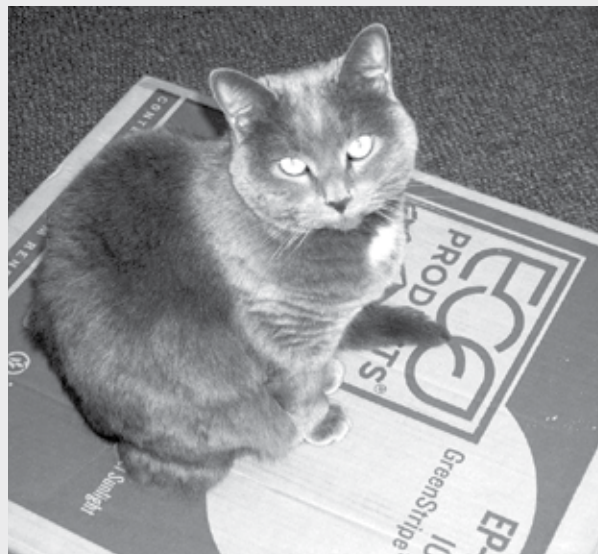
"My new bed. I love to crawl in and take a nap!"